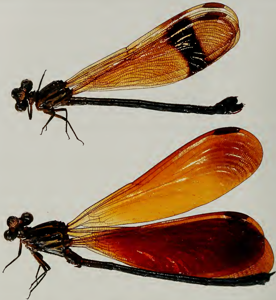
Fig. 1. Polythore spaeteri , spec. nov., allotype female (top), holotype male (bottom).